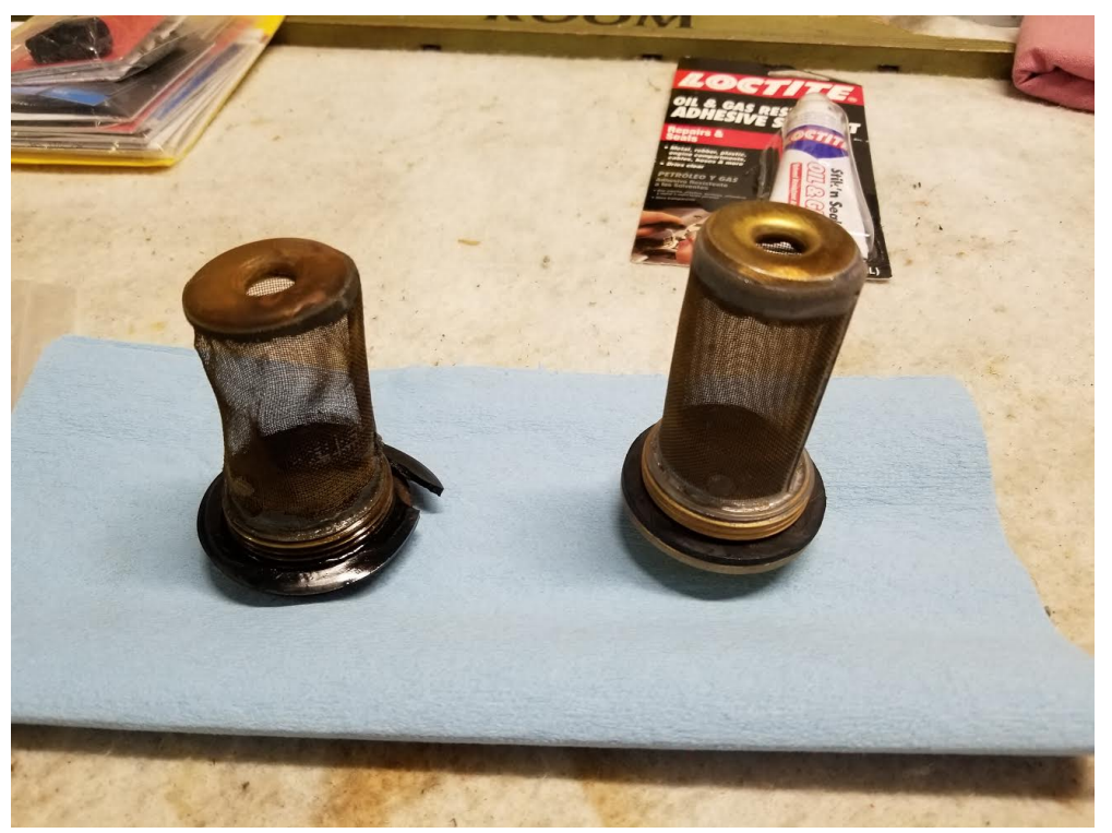
A side by side of the new and old drain plug and its integrated brass mesh filter.

When I got back to the car in mid-November, I remembered that the last time I replaced this gasket, when I drained the remaining gas into that Giant Green Drain Pan<sup>™</sup>, it almost overflowed! So, looking at the gas gauge, it wasn't quite down on empty – and the low fuel light hadn't even come on yet. I thought a quick drive would burn off more gas and make draining the rest a bit less uncomfortable.