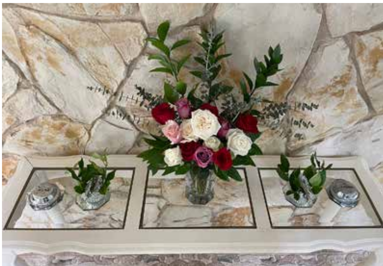
How many people enjoy an entry table with center caps from their Grandmother's XKE, Leapers and Roses