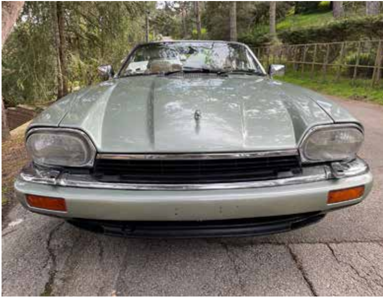
There is something so suave about the timeless XJS.