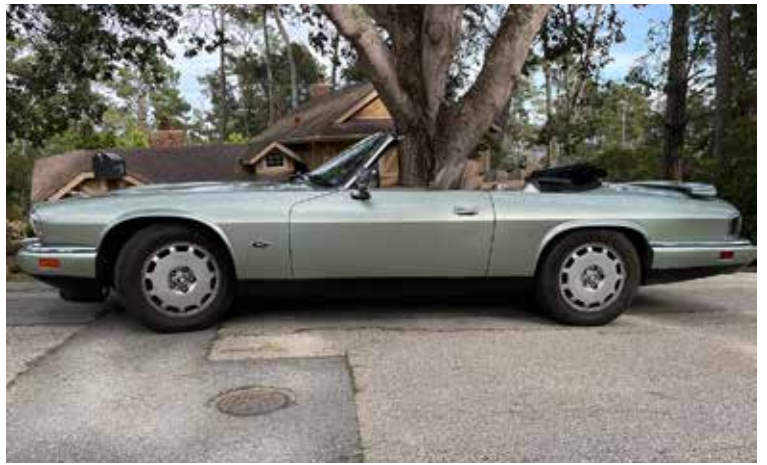
The beautiful Belcher convertible.