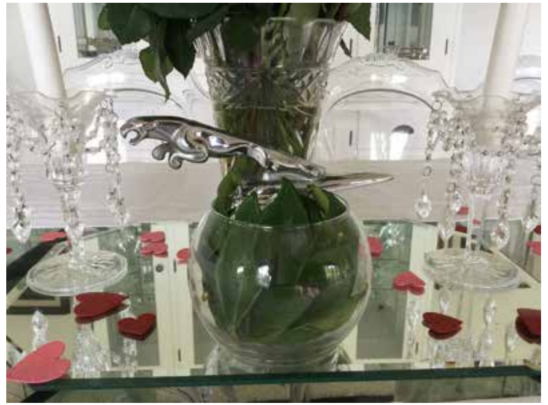
My favorite centerpiece.