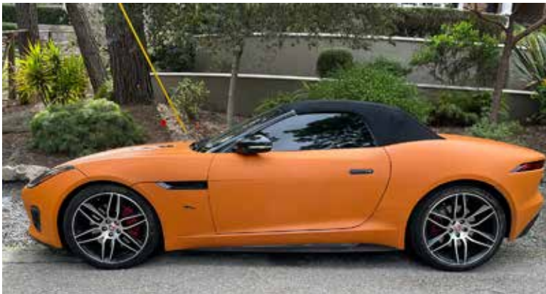
The absolutely ferocious Frangadakis F-Type P300 Turbo.