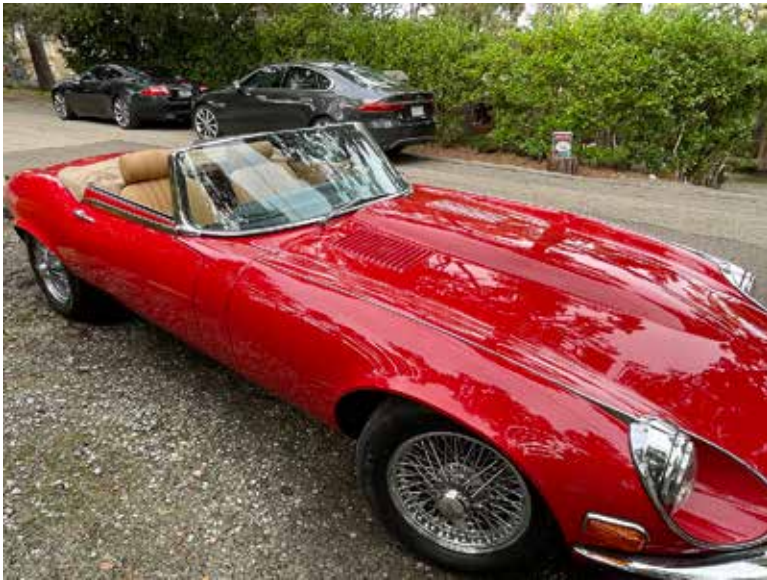
The stunning view in front of our house.