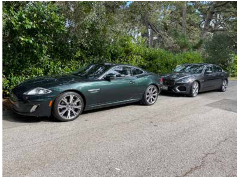
Beauty waiting to pounce.