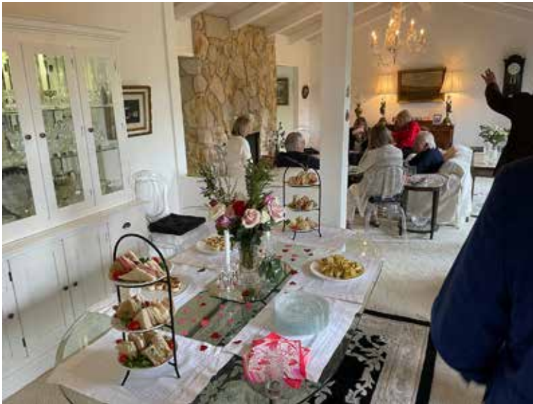
Food and friends make for a grrrreat day!