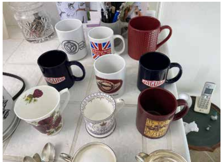
We had to add some of our car mugs to the standard tea cups.