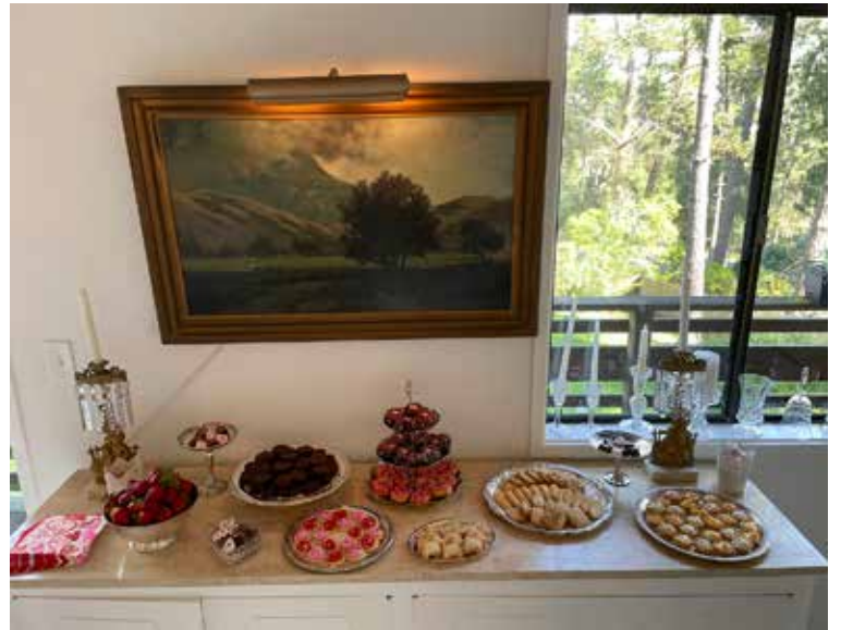
The dangerous sweet zone.