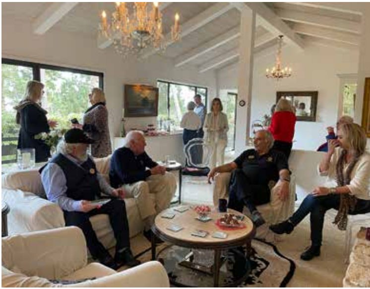
Deep conversation in the living room.