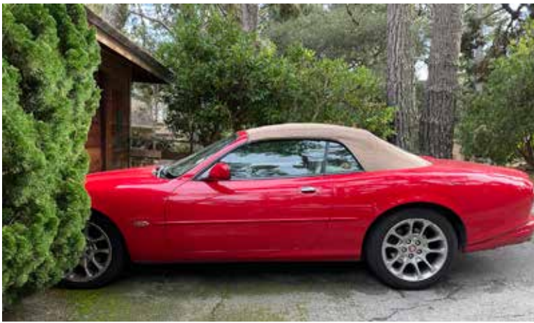
Our President's convertible.