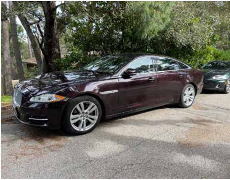
Loving this color on the Church's fantastic XJL.