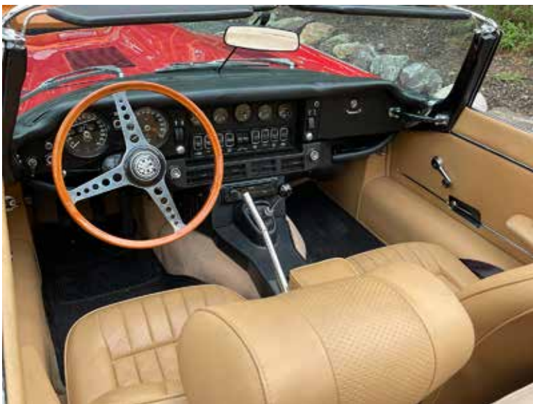
Yes, I drool everytime I see this interior.