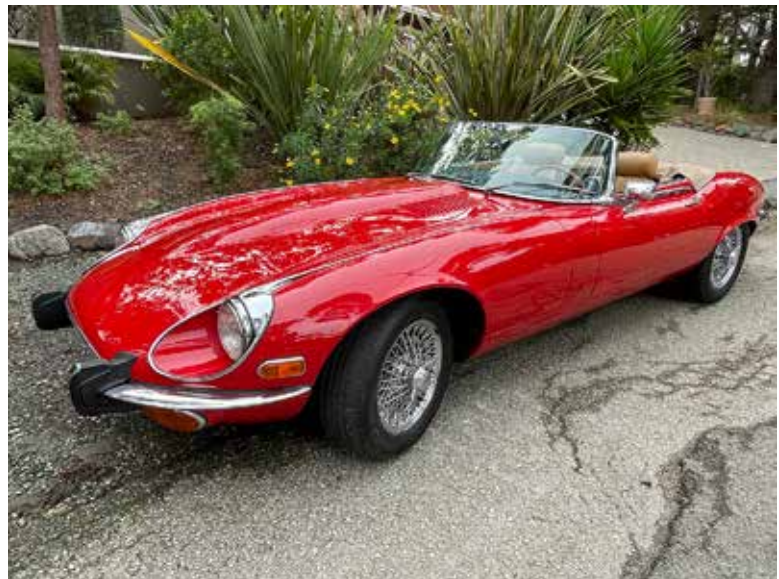
Enzo called it right!