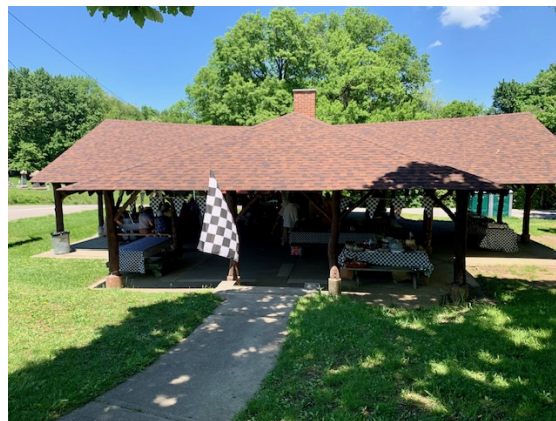
Roosevelt Shelter

Another wonderful JCOP picnic will occur on Sunday, May 18, 2025 starting at 1:00 PM. It will be again held in North Park at the Roosevelt Shelter , which has been reserved for JCOP. There is excellent parking immediately adjacent to the shelter where our members can display their vehicles and everyone can convene. Real “running water” rest rooms are also adjacent to the parking area and this is the same location of the picnic from last year that everyone enjoyed so much.